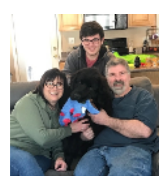
Monte will be living with 2 Newf siblings and parents Tom and Cathie in CT.