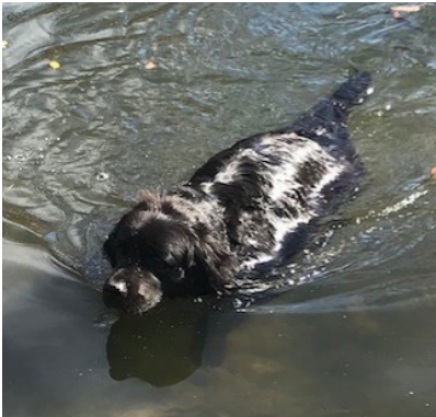
Zelma, also known as "Zee"

Zelma and Wally were rescued from a puppy mill in Ohio and have been together at That Newfoundland Place since July. Although TNP has potential placements for Wally and Zelma separately, the staff has decided to place them together.