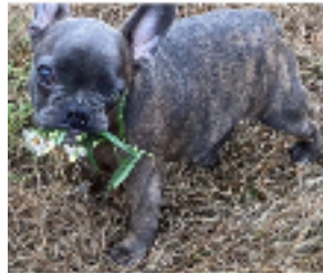
Stripe is at TNP

Three French Bulldogs , one at TNP and two in a foster home, are still under TNP care. Two of the three have an upcoming follow up appointment with the eye specialist. They are on multiple eye drops daily but are doing well overall.